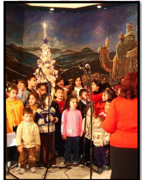
Right: A children's Christmas program in Bethlehem.

Designate your giving to ICEJ Aid: Holidays.