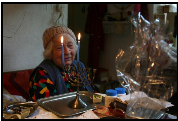
Left: A Holocaust survivor celebrating Chanukah.